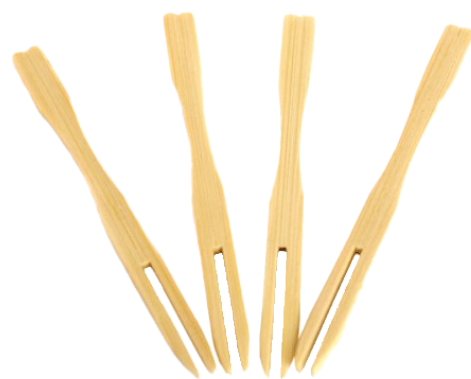
WOODEN FRUIT PICK